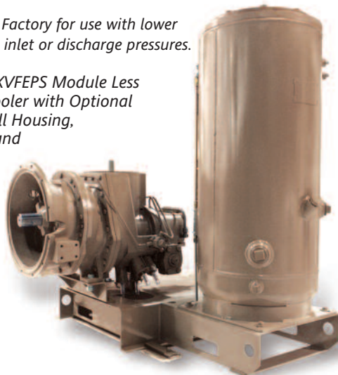
MHG17XXXVFEPS Module Less Oil/Aftercooler with Optional SAE # 2 Bell Housing, Versatrol, and Oil Pump with Fan Shaft Extension

* Consult Factory for use with lower vacuum inlet or discharge pressures.